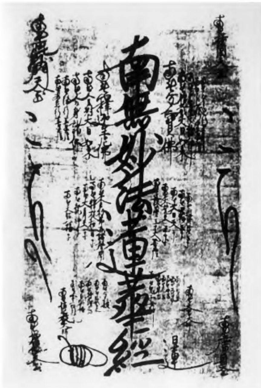
Figure 1. Mandala drawn by Nichiren. No date; attributed to Bun'ei 11 (1274). One of the largest honzon Nichiren inscribed for his followers: made of twenty sheets of paper, it measures 189.4 x 112.1 cm. It is one example of the “formal” style.