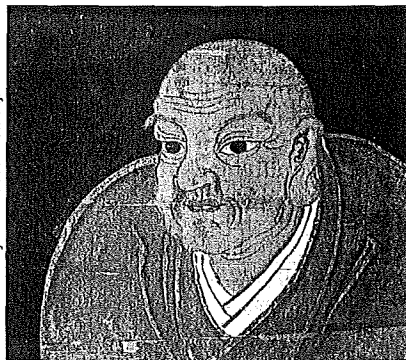
Portrait of Nichiren painted by Fujiwara Chikayasu in 1282, owned by Kuonji, the head temple of the Nichiren sect of Japanese Buddhism, in Yamanashi Prefecture.

did their persecutors receive no obvious karmic retribution?